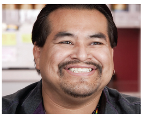
ANALYSIS OF POLICIES, PRACTICES, AND PROGRAMS FOR ADVANCING DIVERSITY, EQUITY, AND INCLUSION